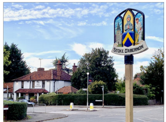
The sign at the junction of Stoke Road and Blundel Lane

Not to be outdone by the rash of village signs that have been appearing in recent years, Stoke d'Abernon now has its own village sign. The sign actually has been several years in coming to fruition not only with the making, but with various legal formalities. A small committee was formed